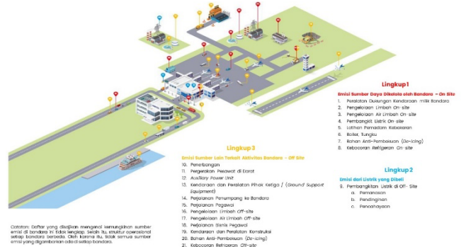
Fig. 1. How do Carbon Emissions occur at Airports?

The consensus formed at the High Level Meeting-ICAO Long Term Aspirational Goal (LTAG) in 2022 was that civil aviation contributed 2.5% of global carbon emissions and agreed to a Net Zero Carbon (NZC) consensus by 2050. At this meeting the Commission on Aviation Environment Protection (CAEP) said that towards NZC 2050, efforts related to Sustainable Aviation Fuel (SAF) management contributed 71%, aircraft technology management contributed 12%, airport operations and flight traffic contributed 9%, and the Carbon Offsetting Reduction Scheme for International Aviation (CORSA) by 8%.